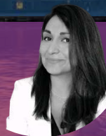
Asimina Basdani Ministry of Digital Governance & Health Greece