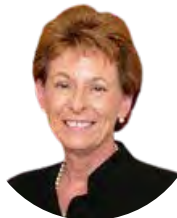
Lady Olga Maitland

Senior Director, Int'l Security Stryker UK