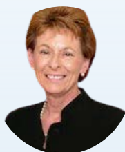
Lady Olga Maitland