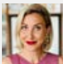
Jelena Matone CISO European Investment Bank LUXEMBOURG