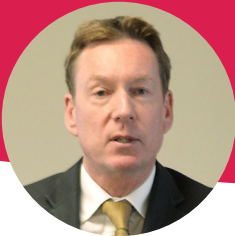
Frank Gardner OBE, Security Correspondent, BBC, Journalist and Author