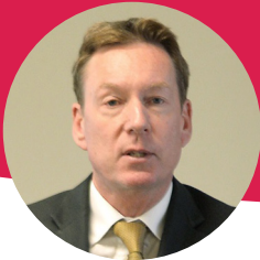
Frank Gardner OBE, Security Correspondent, BBC, Journalist and Author

A prestigious international speaker panel includes